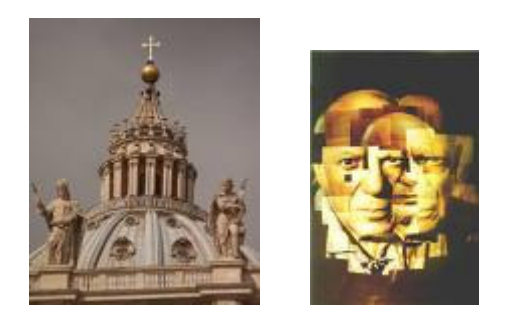
Figure: Leonardo Da Vinci and Picasso did some of their best work in later life

Don't predict the end of your life too early – you could live for another 20 years! Learning new ways of seeing the world keeps the mind and body growing. Always have a goal for the future – no matter how small.